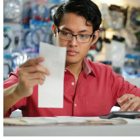
Asian American Business Development Center This organization was established in New York City in 1994 to promote greater recognition of Asian American businesses' contributions to the general economy. AABDC's mission is to assist

is the preeminent organization serving Asian American businesses. The USPAACC's mission is to serve as a gateway organization, connecting Asian American firms and related groups to corporate and government contracts, minority business suppliers, and information about Asian Americans and the Asia market. The USPAACC, which is based in Washington, DC, represents a diverse group of Asian Americans, including those who trace their heritage to China, Hong Kong, Taiwan, Japan, the Philippines, South Korea, India, Indonesia, Vietnam, Cambodia, Thailand, Singapore, Malaysia, Bangladesh, Pakistan, and Mongolia. One of the USPAACC's major annual events is CelebrAsian, the nation's largest procurement conference for Asian American businesses to connect Fortune-level corporations and governments with Asian American and minority businesses to pursue contracting relationships. CelebrAsian 2018 will be held May 29 to June 1 in Bethesda, Maryland. A number of other organizations offer resources targeted directly to Asian American firms. These include: